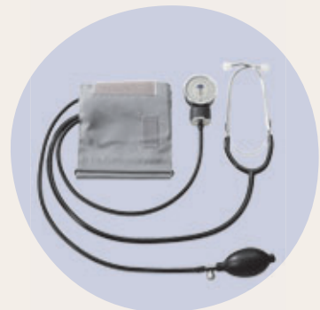
Glucometers and blood pressure cuffs