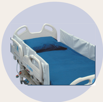
Bedside tables and bedrails