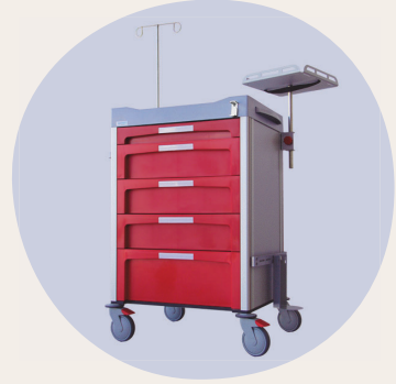
Nursing carts/crash carts